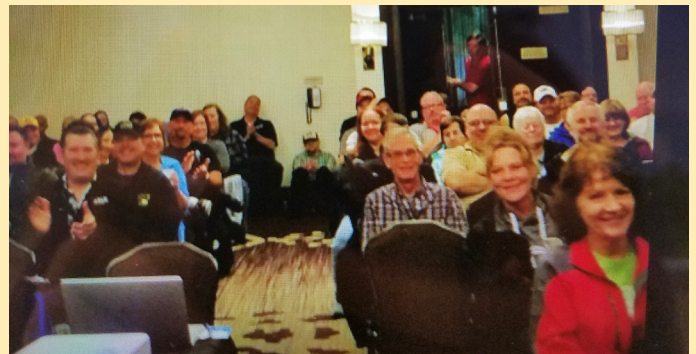
Snapshot of full house at October's membership meeting

The collective bargaining agreements are about good working conditions, fair wages and overall, a better life for ourselves and our families. I'm proud to be working for you to help make this happen. Your voice is important!